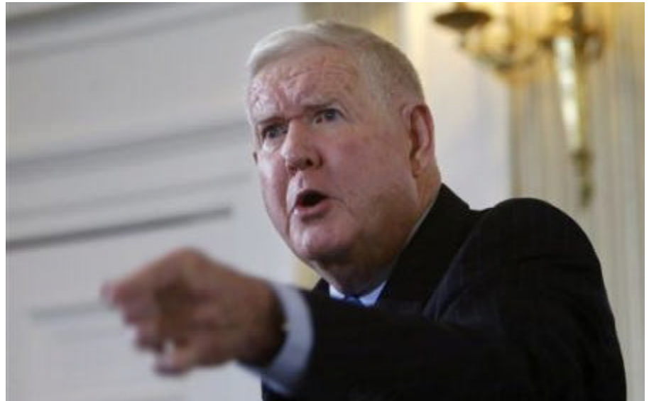
CAP helped Representative John Murtha develop the concept of "strategic redeployment," leftist double-speak for withdrawing troops on a timetable.

The Center is certainly growing at a faster clip than Heritage 30 years ago. According to its tax forms, it took in $11.7 million and spent $2.9 million in 2003, its first year of operation. In 2005, the latest year available, donors contributed $22.9 million and expenses were $16.2 million.