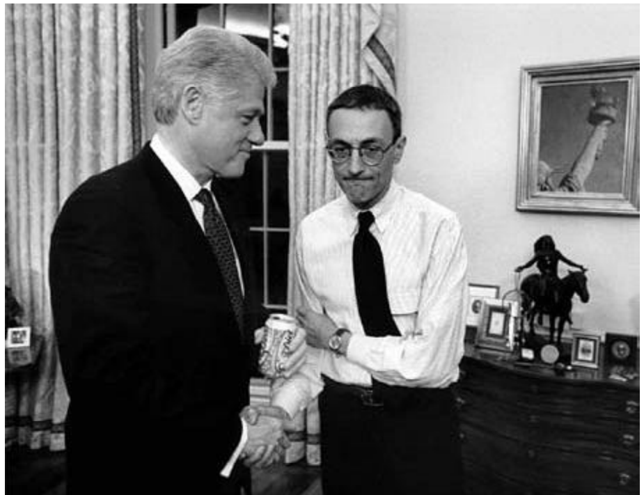
President Bill Clinton (left) with John Podesta (right), on January 19, 2001, Clinton’s last full day as U.S. president. Podesta, now head of the Center for American Progress, was White House chief of staff from 1998 to 2001.

The Center likes to note that its experts had racked up more than 300 appearances on TV news programs in the eight months following its founding in 2003. CAP founder John Podesta, onetime White House chief of staff to Bill Clinton, has gone mano a mano in televised fisticuffs with conservative media pugilists Bill O’Reilly and Sean Hannity, and the Center has been churning out white papers and holding conferences on a host of issues ranging from immigration reform to repealing the military’s “Don’t Ask, Don’t Tell” policy. Last year, it was turning out monographs mapping out “a responsible exit” of U.S. forces from Iraq.