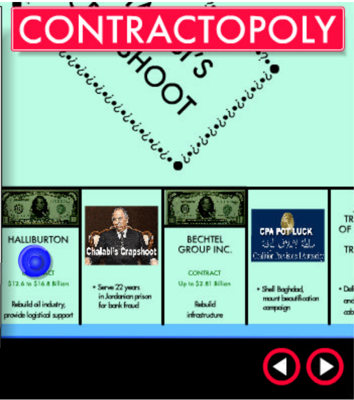
“Contractopoly,” on CAP’s website, mocks President Bush’s Iraq policy.