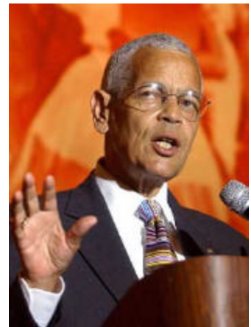
Julian Bond of the NAACP and the SPLC. Bond smeared Republicans and then lied about it.

Bond has smeared black conservatives with relish, deriding them for joining what he calls "a right-wing conspiracy" aimed at eliminating affirmative action, abridging voting rights, and reforming public education. In 2002 he