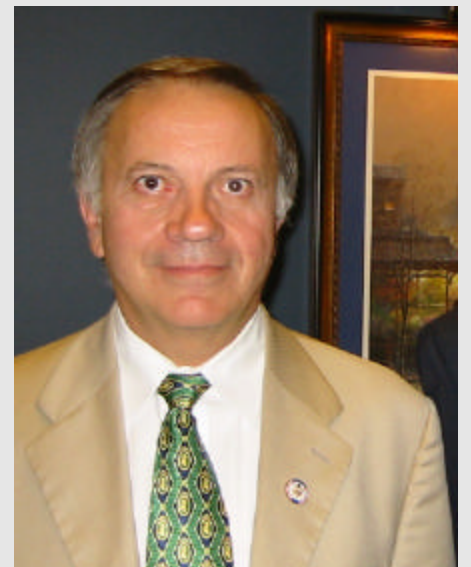
Are conservatives Senator George Allen (left) and Representative Tom Tancredo (right) racists? Yes, according to the Southern Poverty Law Center, a fundraising powerhouse that poses as a public interest law firm.

in original] If the Center’s math is correct, 8,760 “hate crimes” are committed in the U.S. every year and 52 crosses are burned. But that’s not exactly a tidal wave of bigotry in an ethnically diverse nation of 300 million people.