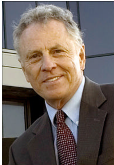
SPLC's Morris Dees

income of nearly $3.5 million. It also reported interest income of $728,356 and "other revenue" of $226,957.