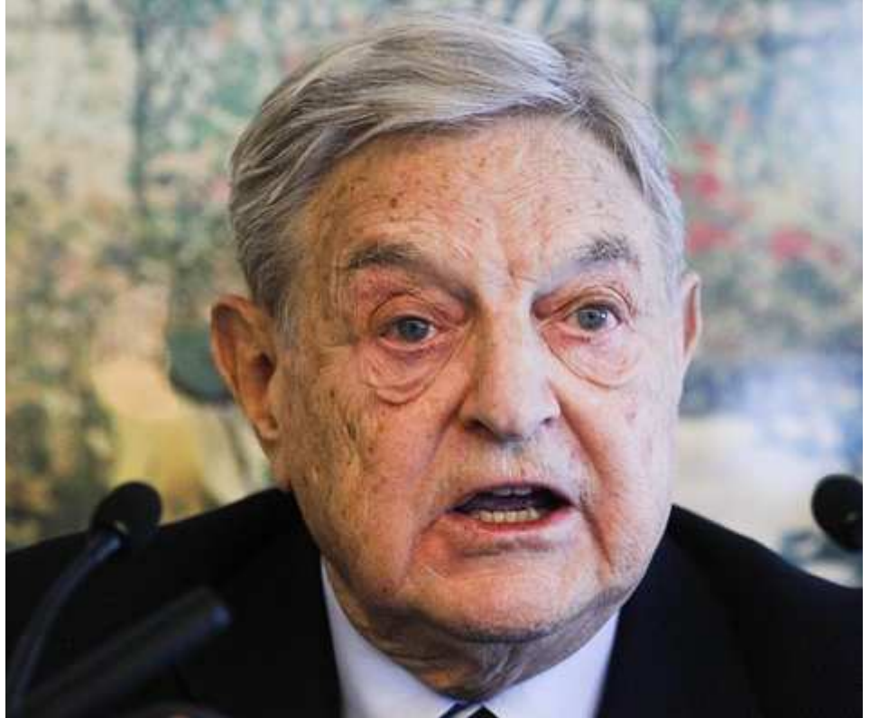
Media Matters benefactor George Soros