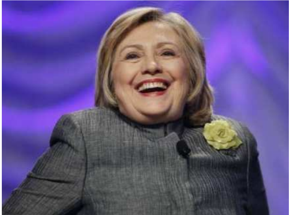
Hillary Clinton boasts that she was instrumental in the creation of Media Matters.