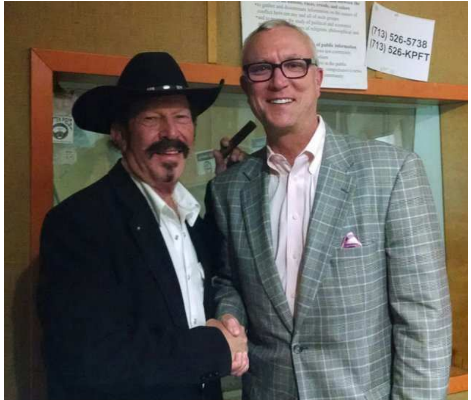
Texas political gadfly Kinky Friedman (left) shakes hands with former U.S. Rep. Chris Bell (D-Texas) in an undated photograph.

This vast network of left-wing funders and activist groups dwarfs anything the activist Right has to offer. It is “self-sufficient and self-perpetuating... an aristocracy of wealth whose dimensions exceed any previous accumulations of financial power, whose influence already represents a massive disenfranchisement of the American people and whose agendas pose a disturbing prospect for the American future,” according to the authors.