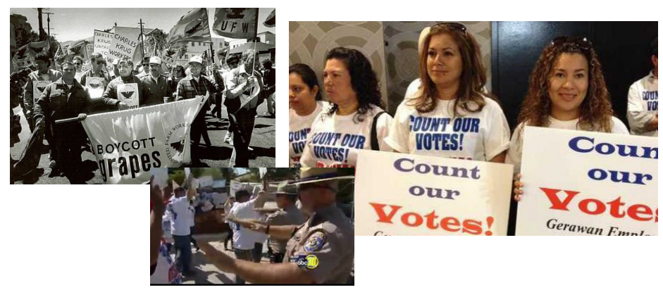
Cesar Chavez used to lead protests by members of the United Farm Workers (left). Now, workers protest the refusal to count votes on decertifying the union.

of a new and growing front in the broad struggle to advance civil liberties in the nizer" when he was hired to work for the