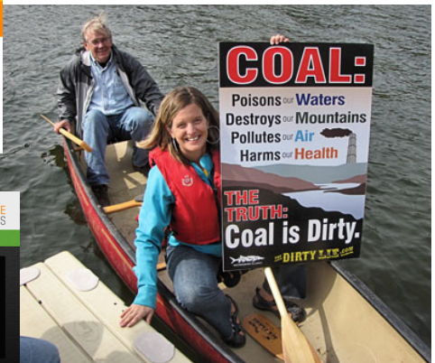
The Sierra Club's promotion of selected "solar energy" companies (seen here on the Web) and its "Beyond Coal" campaign happen to be of financial benefit to the organization and to several members of its board of directors.

arm for private companies—constitute participation in commercial business.