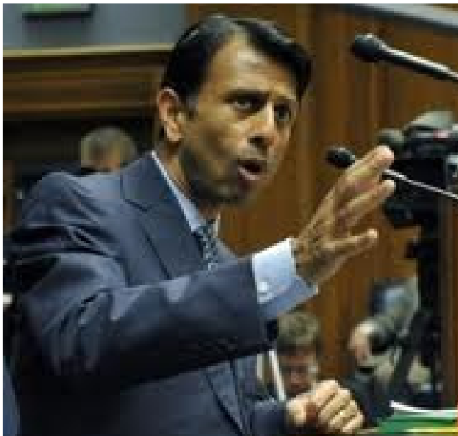
Louisiana Gov. Jindal

But the Jindal reforms go far beyond vouchers. One aspect that hits unions directly is the reform of tenure, the system that prevents teachers from being fired except under extraordinary circumstances. Previously, teachers in Louisiana received this protection—they “earned tenure”—after just three years in the classroom. Under the reforms, teachers would receive tenure only after being rated as “highly effective” for five years in a six-year period, while teachers rated as “ineffective” would lose tenure and be required to re-earn it. (One esti-