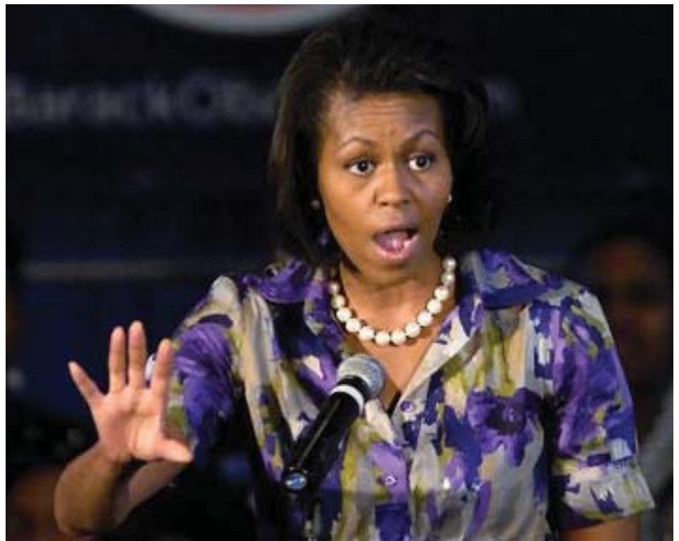
Would-be First Lady Michelle Obama has difficulty saying good things about America.