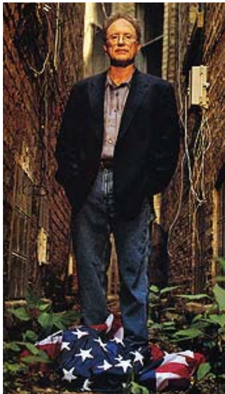
Obama's associate William Ayers says claims that America is "a just and fair and decent place" make him "want to puke." He posed for this 2001 photograph for Chicago magazine while standing on the American flag.

As McCain languished in the Hanoi Hilton, Obama's friends Ayers and Dohrn spent the 1970s waging war against the United States and fleeing justice. They surrendered in 1980 but a legal technicality led to all charges against them being dropped. Ayers gloated: "Guilty as sin, free as a bird, America is a great country."