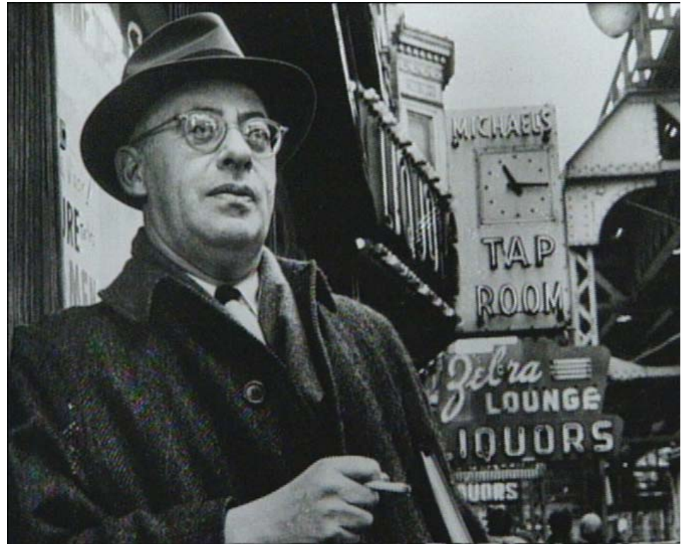
Obama absorbed the teachings of Chicago's Saul Alinsky (1909-1972), the father of community organizing.