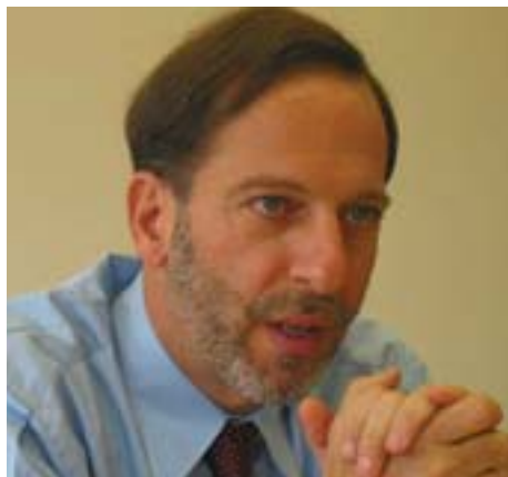
Former PLO spokesman and Yasser Arafat confidante Rashid Khalidi is a friend of Obama.

ACORN’s active involvement in the Obama campaign is likely to be significant. ACORN’s “non-partisan” Project Vote has announced its plans to register hundreds of thousands of voters before the November election. That should concern all Americans