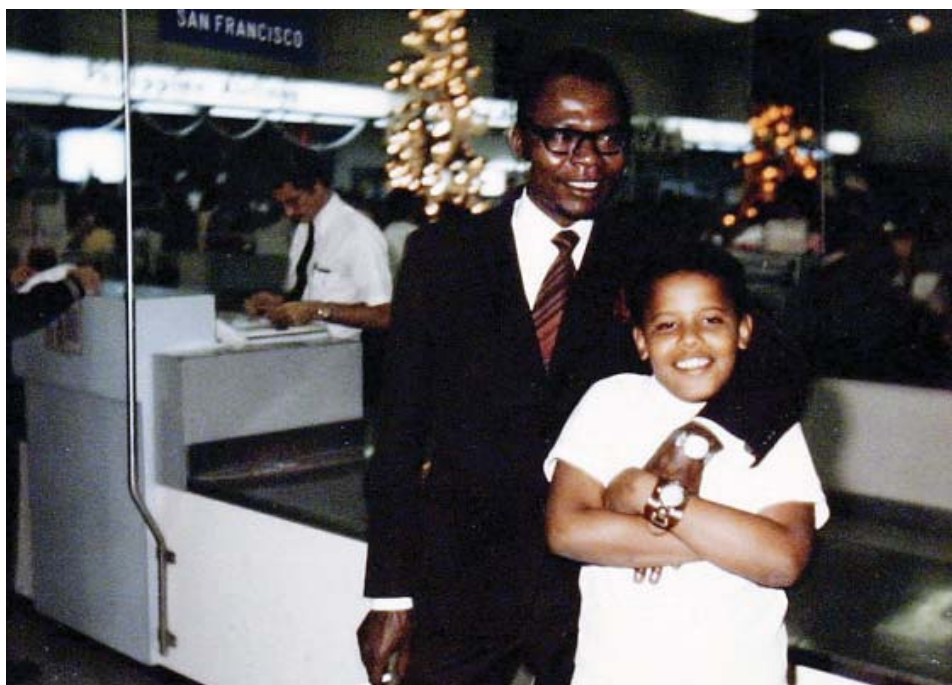
Obama, aged 10, is shown with his father in this photo released by his campaign.