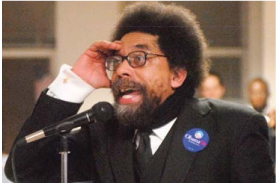
An advisor to the Obama campaign, Princeton professor Cornel West gestures while wearing an Obama '08 pin on his lapel.

In 1992, Obama took time off from his new job at Davis Miner to direct ACORN’s voter mobilization arm, Project Vote, a hugely successful voter registration campaign that helped propel Democrat Carol Moseley Braun into the U.S. Senate by adding an estimated 125,000 voters to the rolls. Project Vote is an ostensibly independent 501(c)(3) that claims to conduct “non-partisan” voter registration drives, counsels potential voters on their rights, and litigates on behalf of the poor and “disenfranchised.”