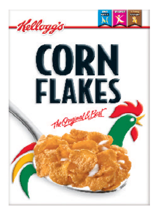
The Kellogg Company, and Kellogg's Corn Flakes --which were invented by the Kellogg brothers-- both turned 100 last year. At left, an early design of the cereal box, with current design at right.