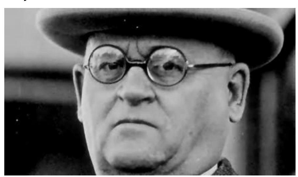
The late W.K. Kellogg (above) founded a breakfast food empire and what became the seventh-largest U.S. foundation, but offered scant guidance on spending his money. An avid conservative who denounced the "Socialist trend" in politics, today his now-liberal foundation's programs promote stronger, more intrusive government.

tion. Since its creation in 1930, Kellogg has been one of the nation's biggest foundations. Even now, according to the Chronicle of Philanthropy, Kellogg is the nation's seventh-largest foundation (in 2006) with $7 billion in assets.