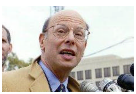
Center for Constitutional Rights president Michael Ratner

Left-leaning civil rights pressure groups that habitually exaggerate the scope of racism in the United States are keen to set a common agenda that will restore concern for "racism" to the top of Congress's list of priorities.