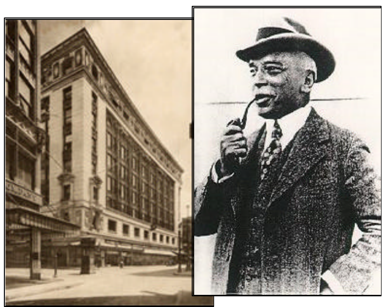
Edward A. Filene, of the department store fame, founded the organization that would become the Century Foundation in 1919.

The Century Foundation is one of the Left's oldest think tanks, putting out scores of op-eds and policy briefs on issues ranging