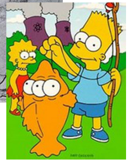
Anti-nuke protesters warn us of the dangers of zombies and Godzilla—not to mention radiation-caused giant ants (in the movie Them! ) and three-eyed fish (in The Simpsons ).

birth defects. The actual number of birth defects believed to have been caused by the radiation? Zero.