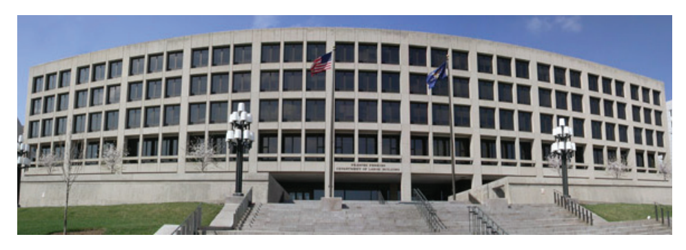
The Frances Perkins Building. Good luck finding the OLMS.

Labor Watch is published by Capital Research Center, a non-partisan education and research organization classified by the IRS as a 501(c)(3) public charity. Reprints are available for $2.50 prepaid to Capital Research Center.